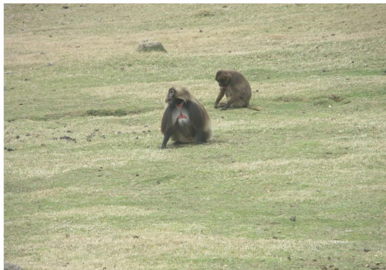
Fig. 1 Adult male and female gelada baboon

The altitude of the area ranges from 2000 to 3730 m.a.s.l. Its topography is characterized by extremely steep slopes whereby the forest is located on the east side of the mountains (Eyosias and Teshome 2015). The area is also found on the division site forming the base for the Blue Nile and Awash rivers. Hence, Wof-Washa is the best