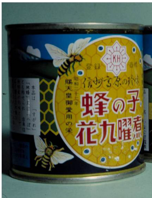
Fig. 3 Canned edible insects in Japan, sold under the name “hachinoko,” meaning bee larvae, although the product actually consists of wasp larvae.

A song sung by the Apatani of North-East India (Fig. 4) to their children as a lullaby in their language is Taiyan yang yangtaiyan yang yang. The lyrics are