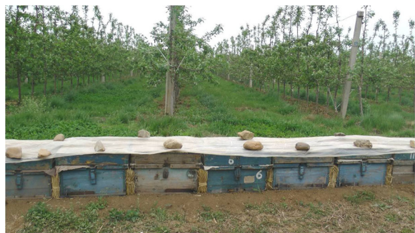
Fig. 5 At North Korea’s Taedonggang Fruit farm more than 3,400,000 apple trees are grown on an area of 1026 ha. To pollinate the apple flowers up to 3000 portable, wooden-framed bee hives (with approximately 20,000 bees per colony), controlled by 100 beekeepers, are distributed around the farm.