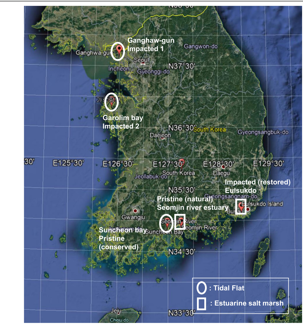
Fig. 1 Map of South Korea showing locations of the five study sites